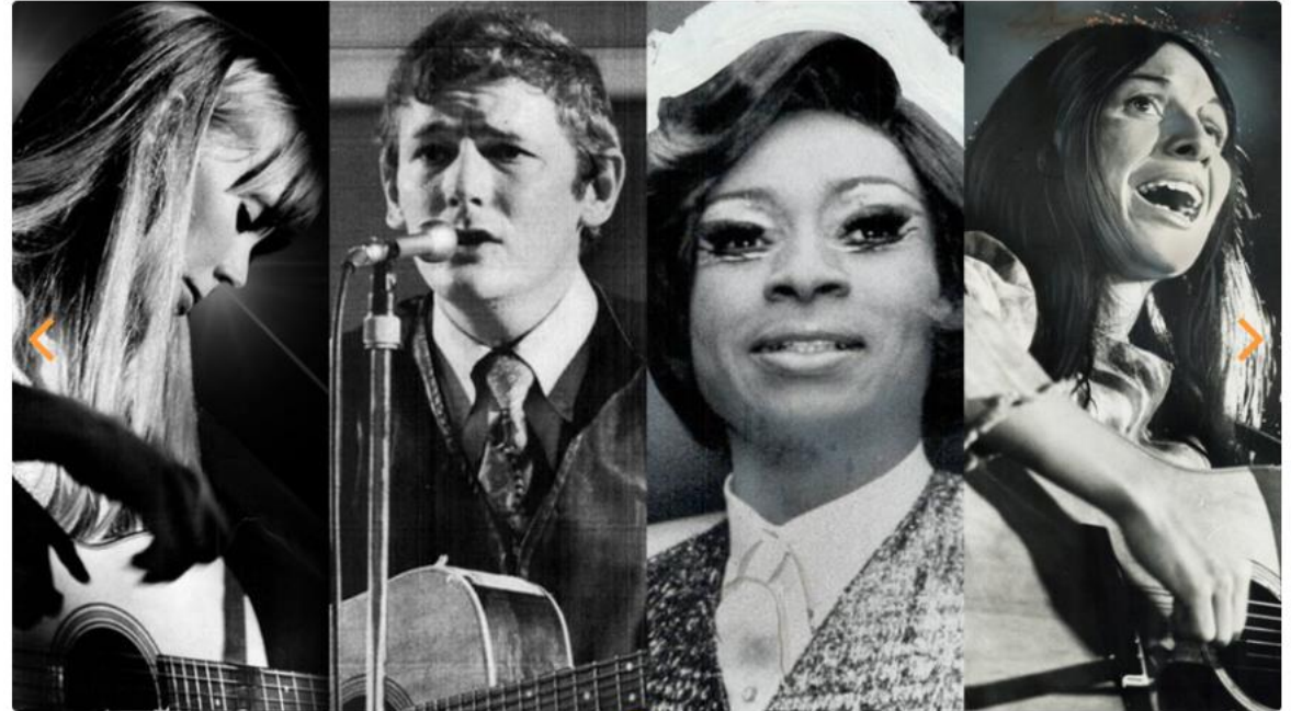
Curious Minds // The Toronto Sound: The Music of Yonge St. and Yorkville