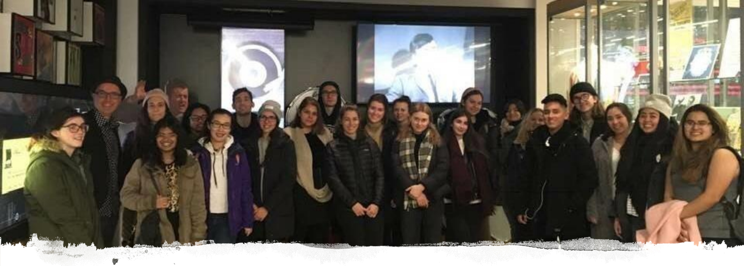
Ryerson University class trip – Music Cultures of the City