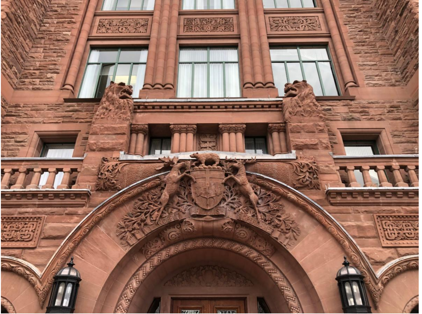
Legislative Assembly of Ontario Queens Park, 2023. Image courtesy of +VG Architects.