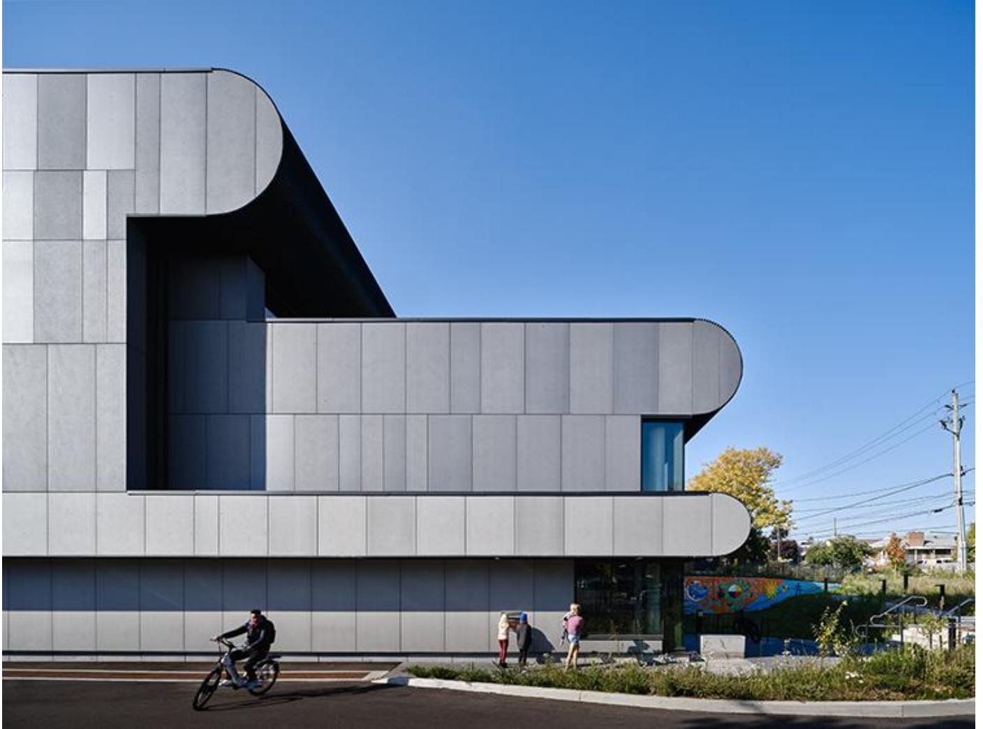
The Transformation of Albert Campbell District Library, 2023.